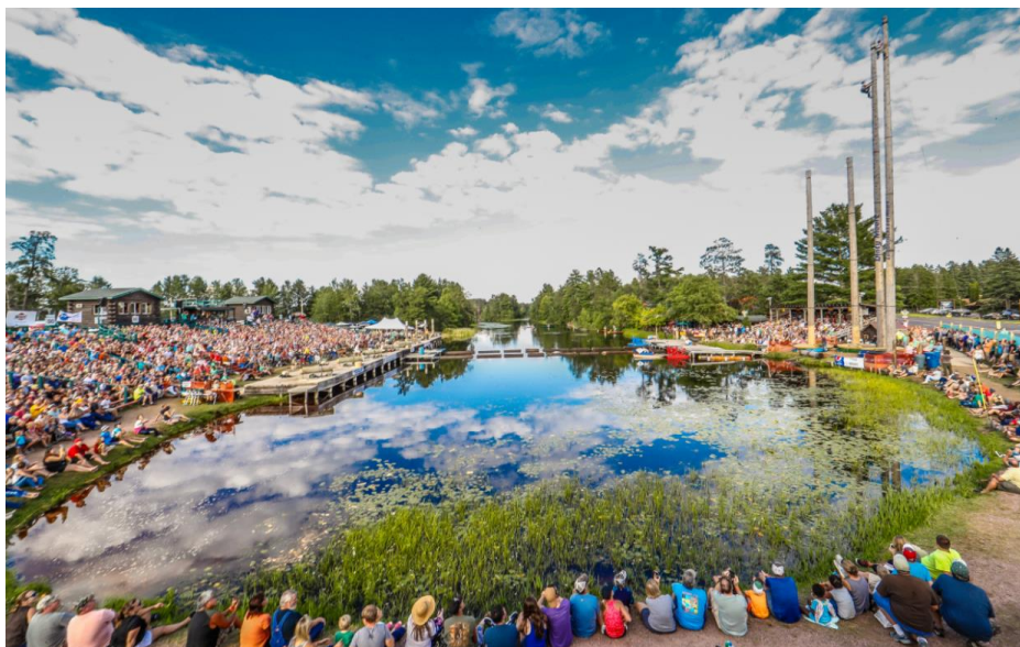
Historic Lumberjack Bowl – Hayward, WI